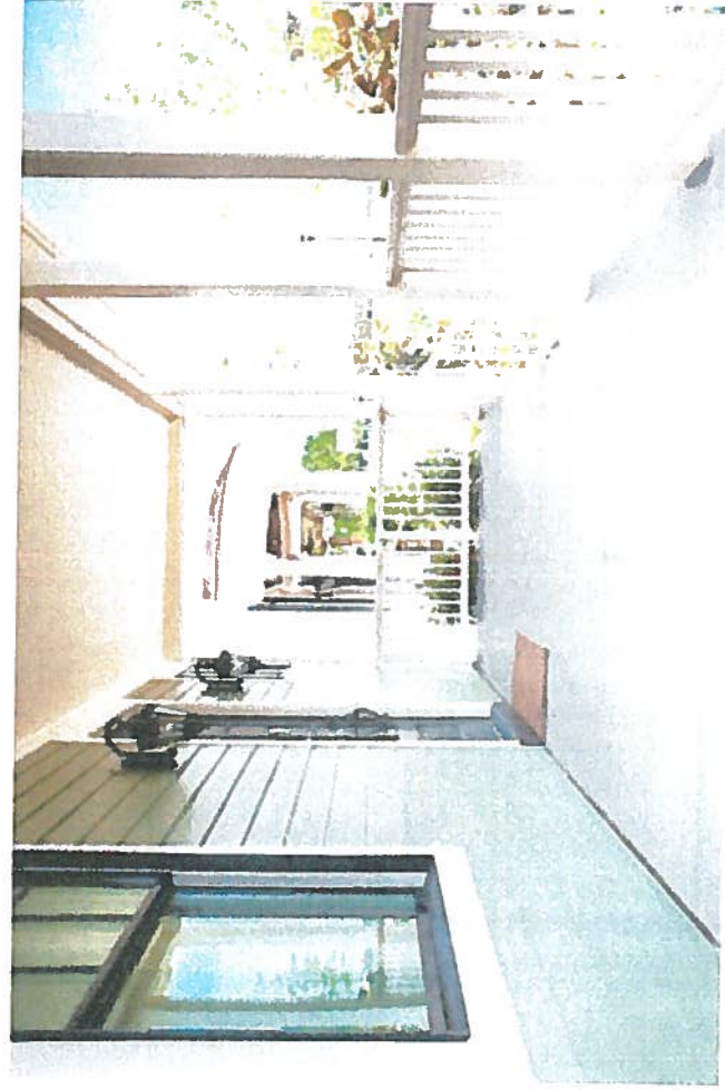
An Aeratis Heritage installation. Click here for the Aeratis photo gallery.

Aeratis Heritage is a true double-sided tongue and groove porch plank that comes in three pre-finished colors, Battleship Gray, Weathered Wood and Vintage Slate. These colored boards are made with slight color variation along with subtle, random streaking to match the richness and depth of natural wood. Heritage, like all the other Aeratis products, can be painted or stained any color, any time in the future, by following the steps within the Traditions paint instructions.